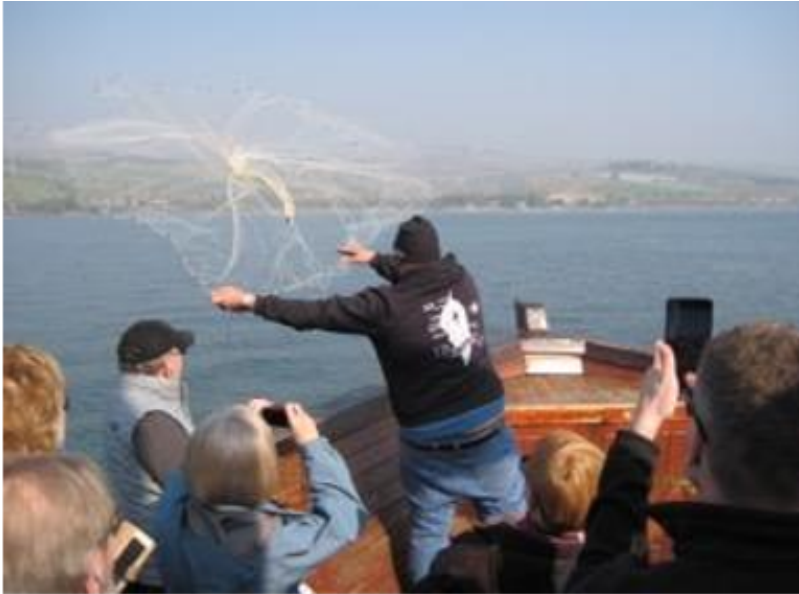
January 2018 Off-shore from Tiberius on the Sea of Galilee. Casting the net.